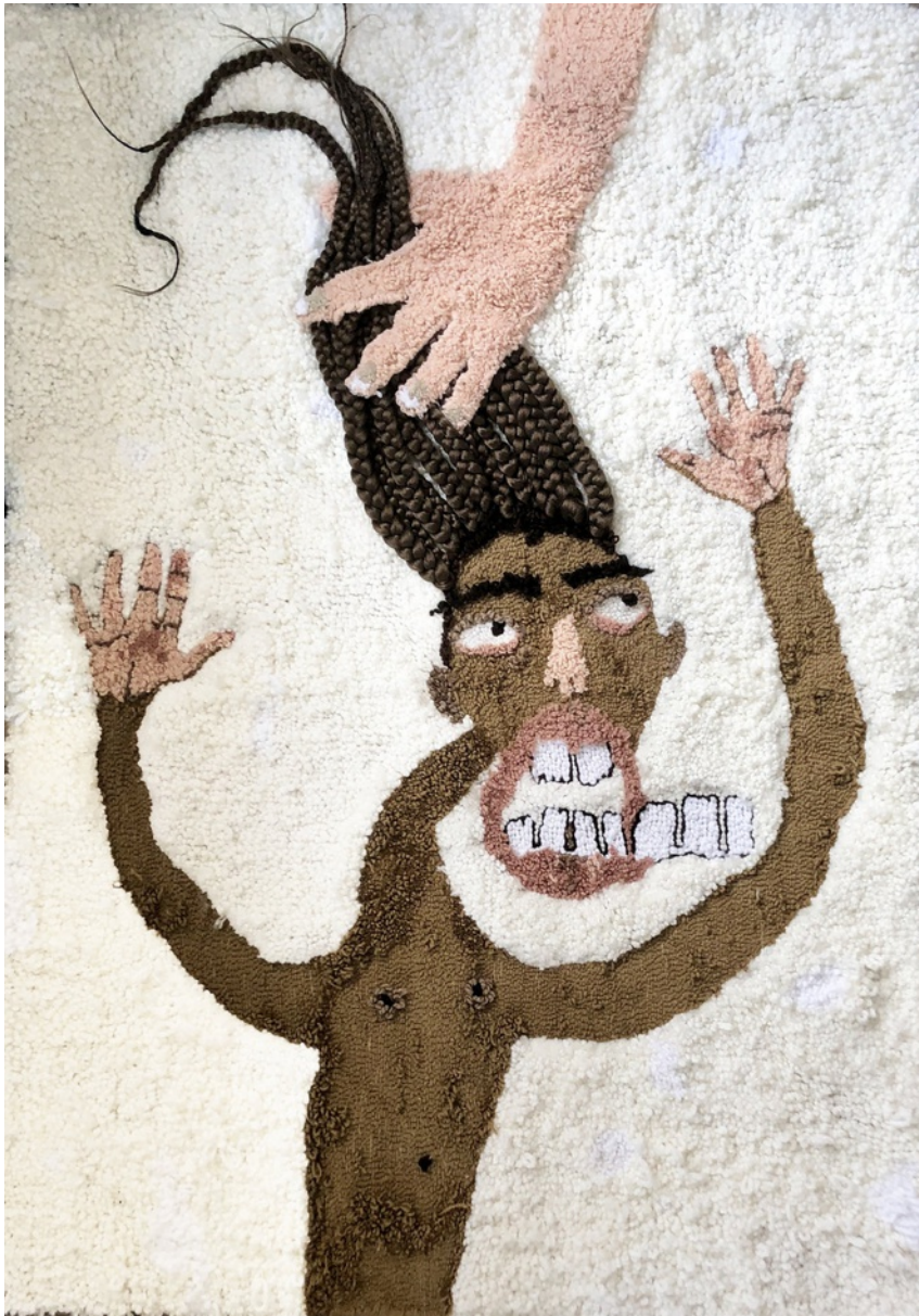
Acrylic, wool and synthetic hair on hessian 68 x 49 inches (ECFA1546)