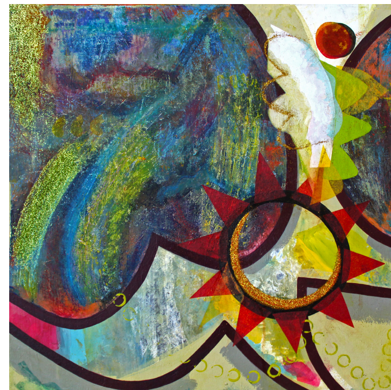
003 Tiffanie Delune - Dancing With The Universe

nial mixed-race background and the epiphanies of adulthood by personifying them as magical creatures in colourful exotic flora, playing with angles, flatness, and depths."