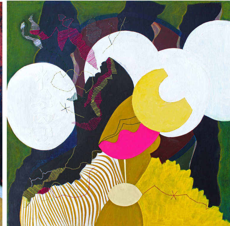
015 Tiffanie Delune - The Unknown