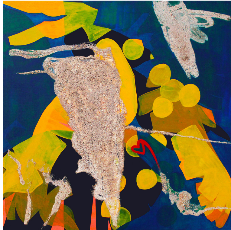
010 Tiffanie Delune - Peeling Off